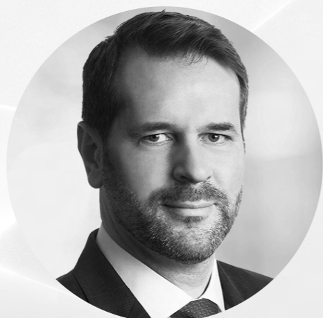
Thales Stucky Indirect Tax